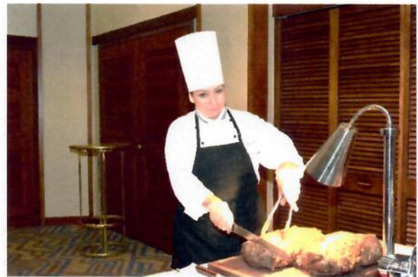
The Aloha Buffet features a Prime rib carving station.

The Board of Directors (Board) are hopeful that through vaccinations and the steady decrease in COVID-19 cases per day will improve that would allow O`ahu residents to attend large social gatherings. Thus, the Board has decided to postpone the Annual Membership Dinner from May 8, 2021, to a date to be determined in October 2021.