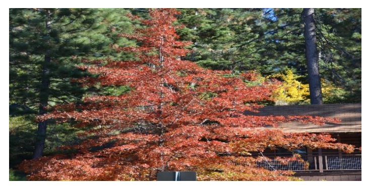
Gold Country ASG Fall 2023 – 4 Day Retreat Zephyr Point Presbyterian Conference Center