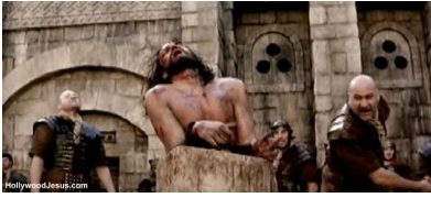
John 19:1 the scourging of Jesus