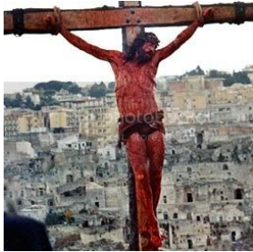
John 19:14-19 The crucifixion of Jesus