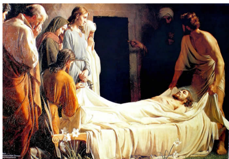
John 19:38-42 The burial of Jesus