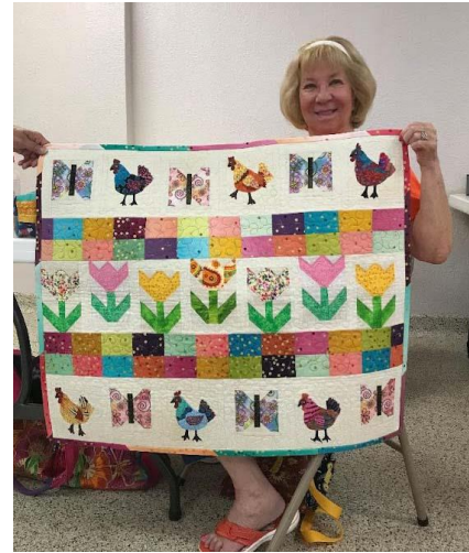
How Much Fun is This Sew Scrappy