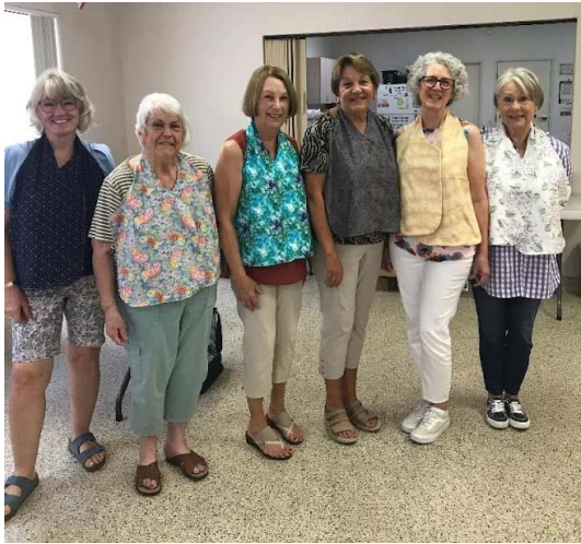
A Day at Hard Work Sew Elegant Members