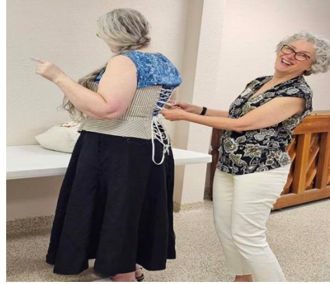
Clothes Fit--Looks like fun was had by all.