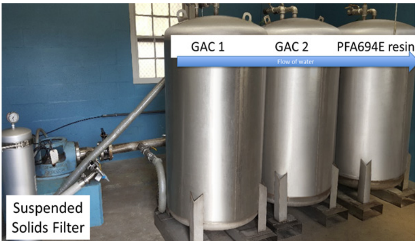
Figure 2. Well 10 Treatment System

for both the GAC and resin media were approximately 34 inches. Sampling points were installed on the outlet of each vessel. An extra sampling point was installed in the resin polishing vessel at 2/3 rd of the resin bed depth. This allowed monitoring corresponding to resin EBCT of 1.8 minutes at the 2/3 rd sampling point and 2.8 minutes for the entire resin bed. The 2/3 rd sampling point would provide advanced notice of PFAS breakthrough and be used to get an earlier estimate of operating capacity for the resin.