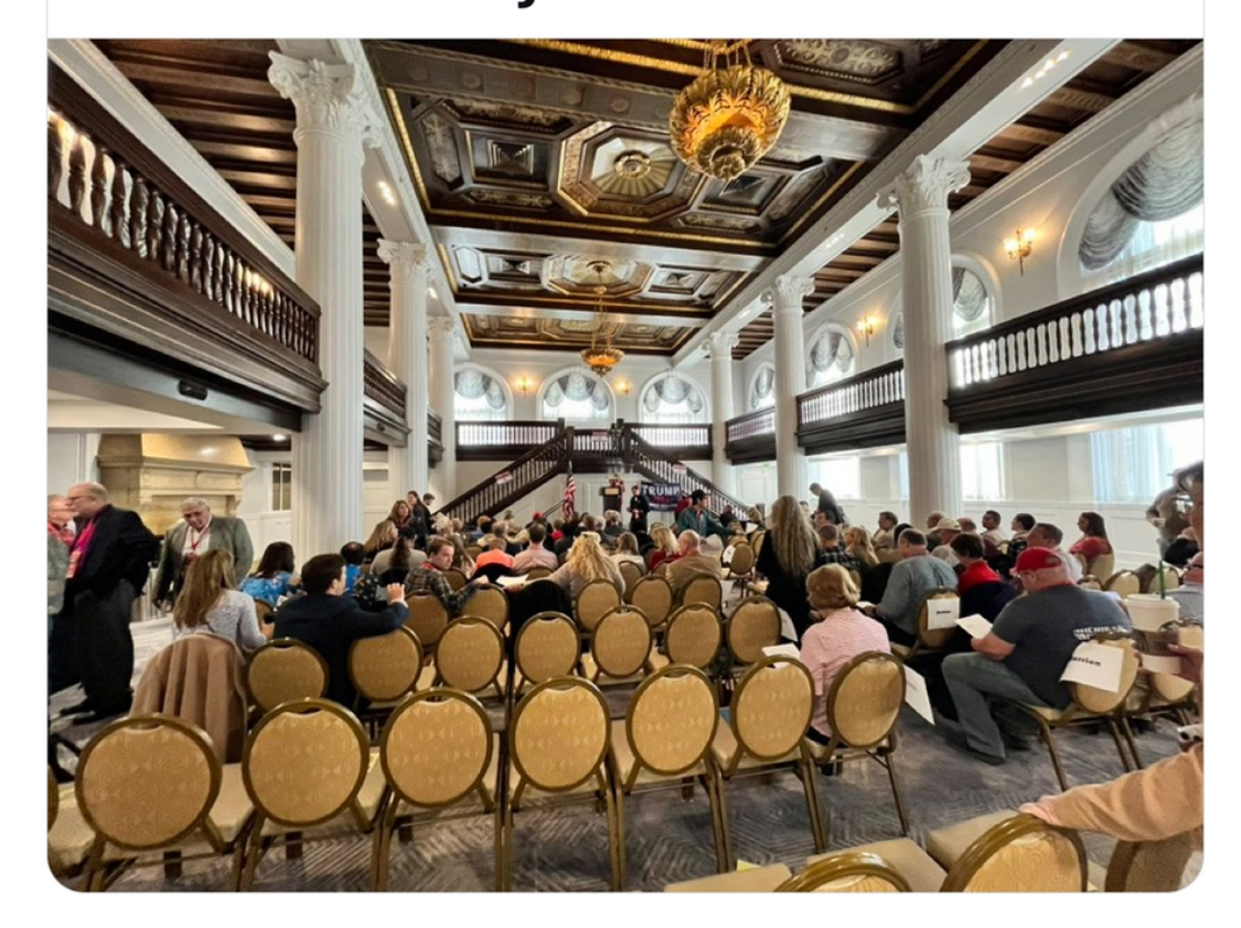
The MIGOP real event:

Here's the turnout in the 4th district convention at the MIGOP caucus in the Amway Grand. Another group from the 4th district is having their own convention in Battle Creek today.