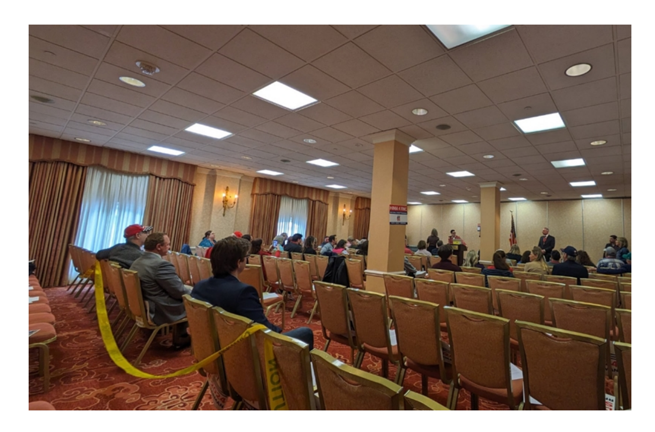
10th District Caucus room: